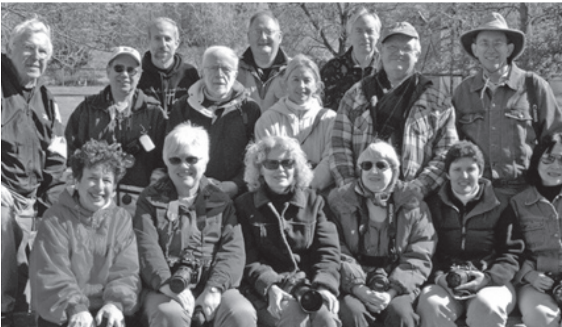
Raptor field trip

Congratulations to the Ridgewood Camera Club on their longevity and community pride. Here’s to the next 70 years! 🍷