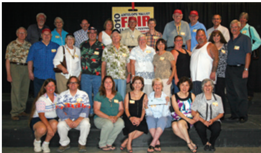
Lancaster Photography Association members attending the Kick Off Dinner before the Antelope Valley Fair & Alfalfa Festival

To learn more about the Lancaster Photography Association visit their Web site at http://www.lpaphotography.com/ ■